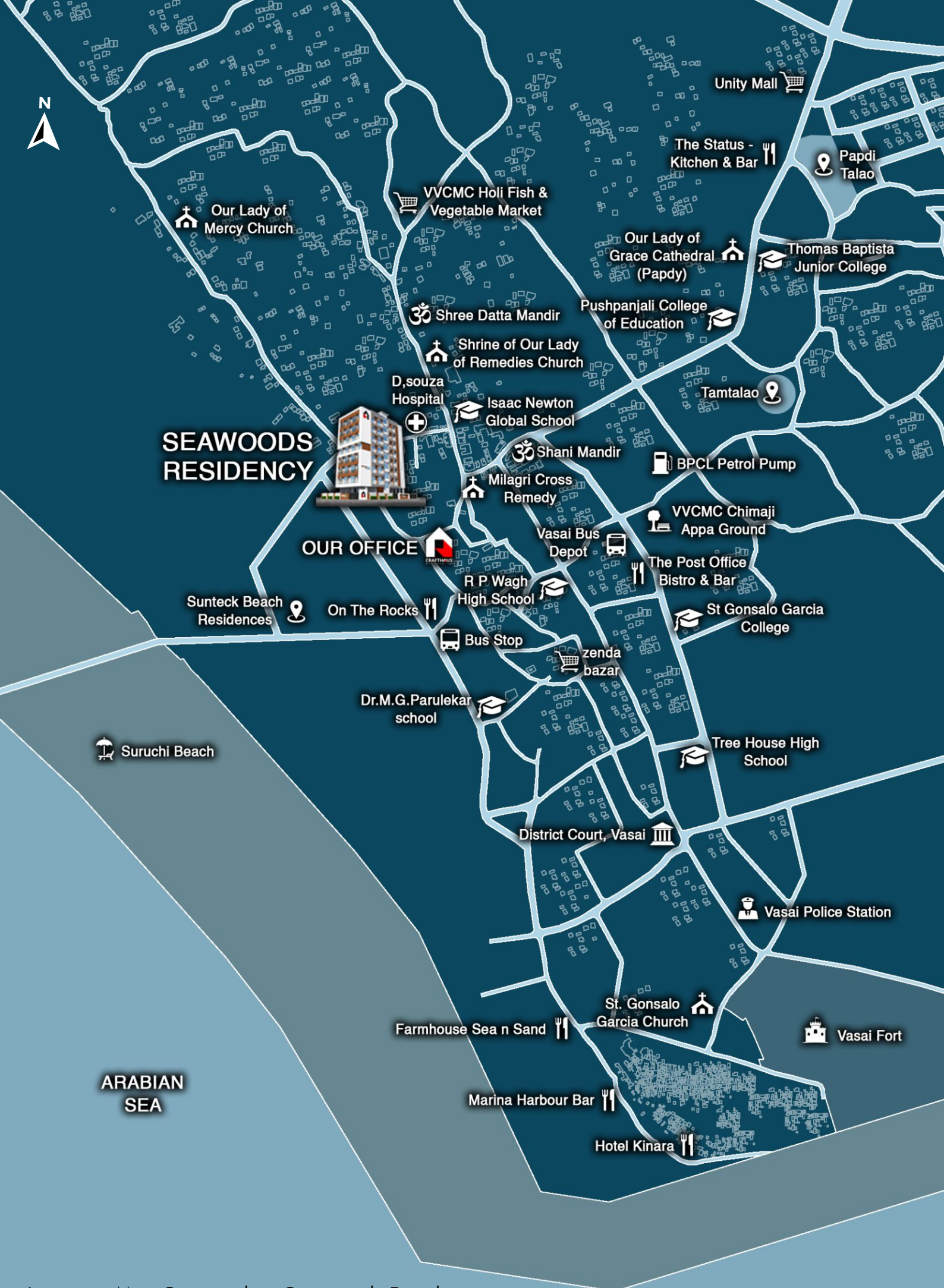
Location Map Surrounding Seawoods Residency.